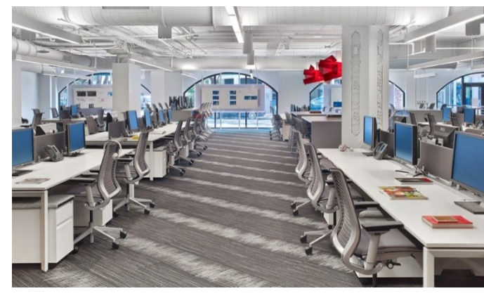
Benching with mobile storage pedestals

Sapient's mobile workplace strategy, "Work is where you are," drives the space design. With 25% of their team working at client sites and only touching down at the Grove 1-2 times per week, there was a transition from private offices to benching applications. Whether you are moving the mobile storage around for impromptu collaboration, taking a private call in a phone booth or working with a team in a small huddle room, the space gives employees the autonomy to find an environment that suits their needs throughout the day. When it comes to activities and socializing, the Steelcase Walkstations, game room, movie theater and work café are destinations for people to unwind and interact. The space makes a bold statement about the commitment to a compelling employee experience.