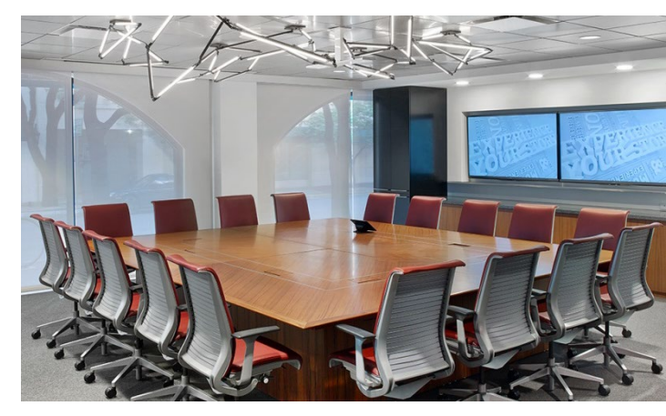
Custom conference room table with Steelcase Think chairs

Customers visiting the Grove experience the creative process while touring the space. A colored line in the carpet serves as the path to view production teams working in real time. The first stop is the editing bays and web design suites, designed to look like large shipping crates. As clients walk through the open plan, they observe different teams collaborating. When it's time to impress, Sapient uses the "pitch room," which immerses and engages clients in ideas presented on wall-to-wall displays. The tour concludes in the movie theater—the stage for displaying clients' final deliverables.