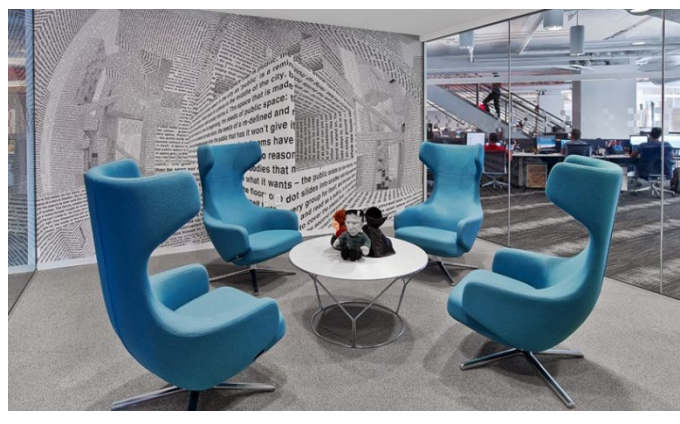
Small huddle room allows for casual collaboration